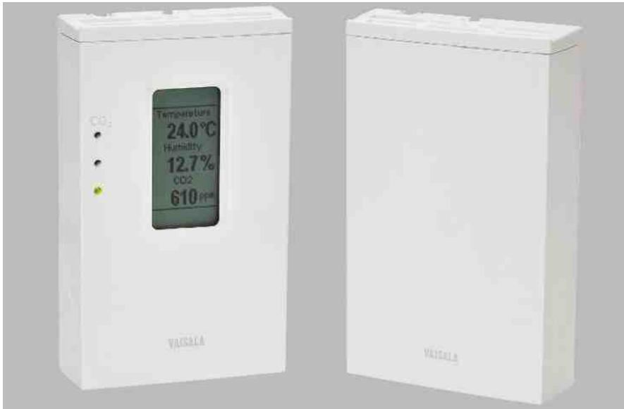
GMW90 Series Carbon Dioxide, Temperature and Humidity Transmitters for HVAC are available with either a display opening or a solid front. An optional traffic light indication can also be selected.

The Vaisala GMW90 Series CARBOCAP® Carbon Dioxide, Temperature, and Humidity Transmitters are based on new measurement technology for improved reliability and stability. With the new technology the transmitter's inspection interval is extended to five years.