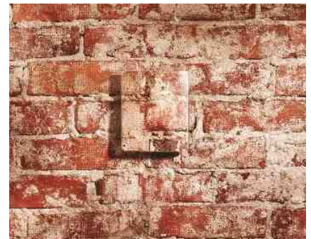
Make the transmitter blend into your interior design with the optional decorative cover.

exchangeable measurement modules. Sensor traceability and measurement quality is easily maintained by snapping on a new module calibrated at Vaisala factory. The instrument can also be calibrated using a hand-held meter or reference gas CO 2 bottle. The service interfaces are easy to reach by simply sliding the cover down. The closed cover keeps the measurement environment stable during calibration and ensures a top-quality final result.